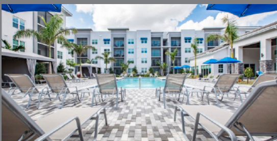
Luma at West Palm Beach